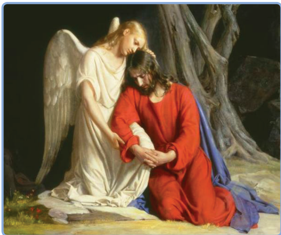
With trust and love, let us pray:

Statistics say that every five minutes someone in the world commits suicide. This reveals great suffering and sorrow in the human heart, the loss of hope and no desire to live. How many of our brothers and sisters are living in despair and crying out for help. Through prayer, we can help them. And God, in his infinite mercy, can save them.